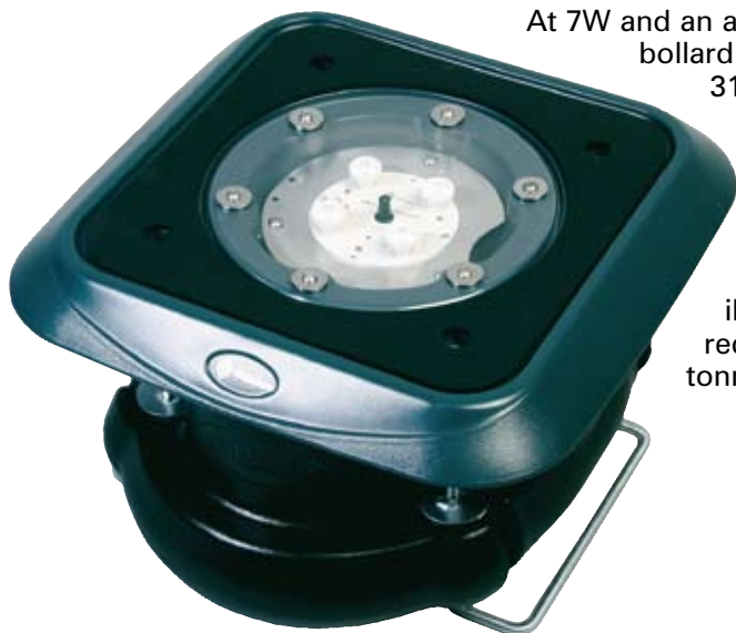
LED Sublite Unit

Each kilowatt of electricity generated in the UK produces, on average, 573 grammes of Carbon Dioxide 1 . Based on this estimate, a single Rebound Signmaster LED bollard reduces the carbon footprint of the installation from 180.701kg to 19.764kg, a saving of 160.937kg per year. Applied to the 362 illuminated bollards in service, Rebound Signmaster LED has reduced Blackpool Council's carbon footprint by 58.26 metric tonnes a year.