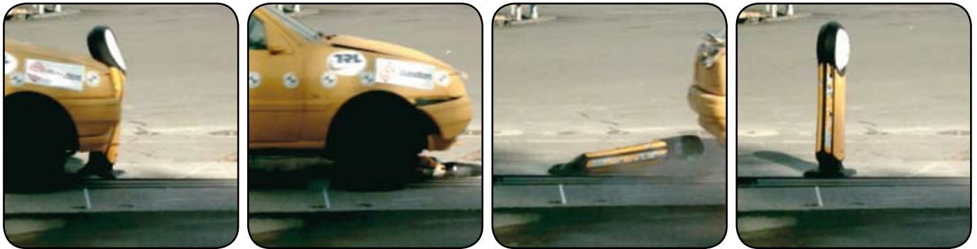
TRL testing footage

Unlike traditional designs of traffic bollard, Rebound Signmaster LED utilises retroreflective patches that conform to national non-illuminated standards, resulting in a bollard that remains effective and highly visible day or night, even in the event of a loss of power.