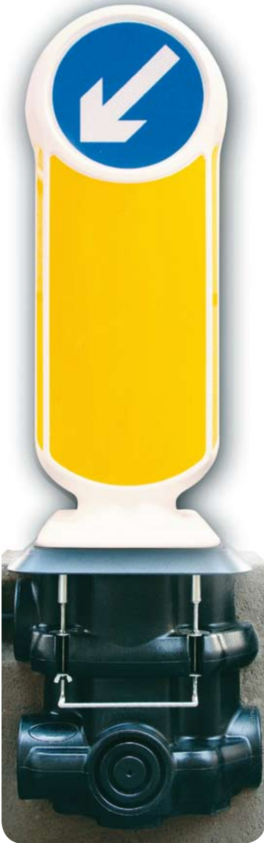
Signmaster c/w LED Sublite and ducting chamber

Glasdon UK worked closely with E.ON to ensure the Rebound Signmaster LED met with their exacting requirements. The Sublite basebox was modified to accept E.ON's preferred remote monitoring system, transmitting a signal by mobile phone containing up-to-the-minute information on each bollard's individual performance and power requirements.