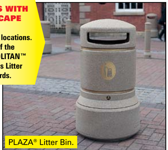
PLAZA® Litter Bin.

Ideal for prestigious locations. EDGE LINER is part of the co-ordinated NEOPOLITAN™ range which includes Litter Bins and taller Bollards.