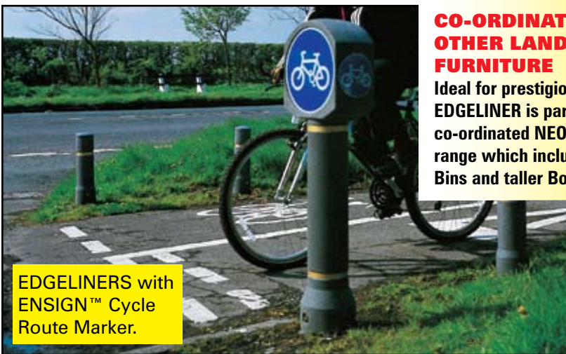
EDGE LINERS with ENSIGN™ Cycle Route Marker.

Highly attractive appearance will complement landscaped areas, either in traditional or modern style environments. EDGE LINER is slightly textured to deter defacing. Available in White or Black or a choice of three attractive stone-effect colour options (please see below).